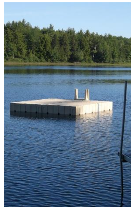
THE NEW FLOATING DOCK